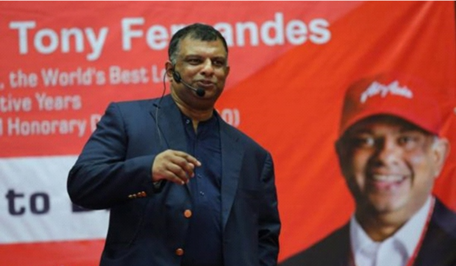
Tony Fernandes during his Premier Lecture at the Dewan Sultan Iskandar, UTM