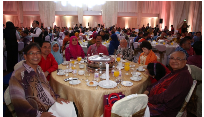
Guests at the Royal Gala Dinner 2017

said the donation would be channeled to the UTM Cares Fund as a fund to be distributed to needy students, either through scholarships or financial assistance to cover the cost of study.