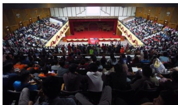
Tony Fernandes speaking to a packed hall

And indeed it has. As per the company's tagline, now everybody can fly. Fernandes ended his lecture by saying “Dreams can be achieved by everyone, as long as you have the courage. It does not matter if you fail, at least you tried; and if you keep trying, one day you will succeed”