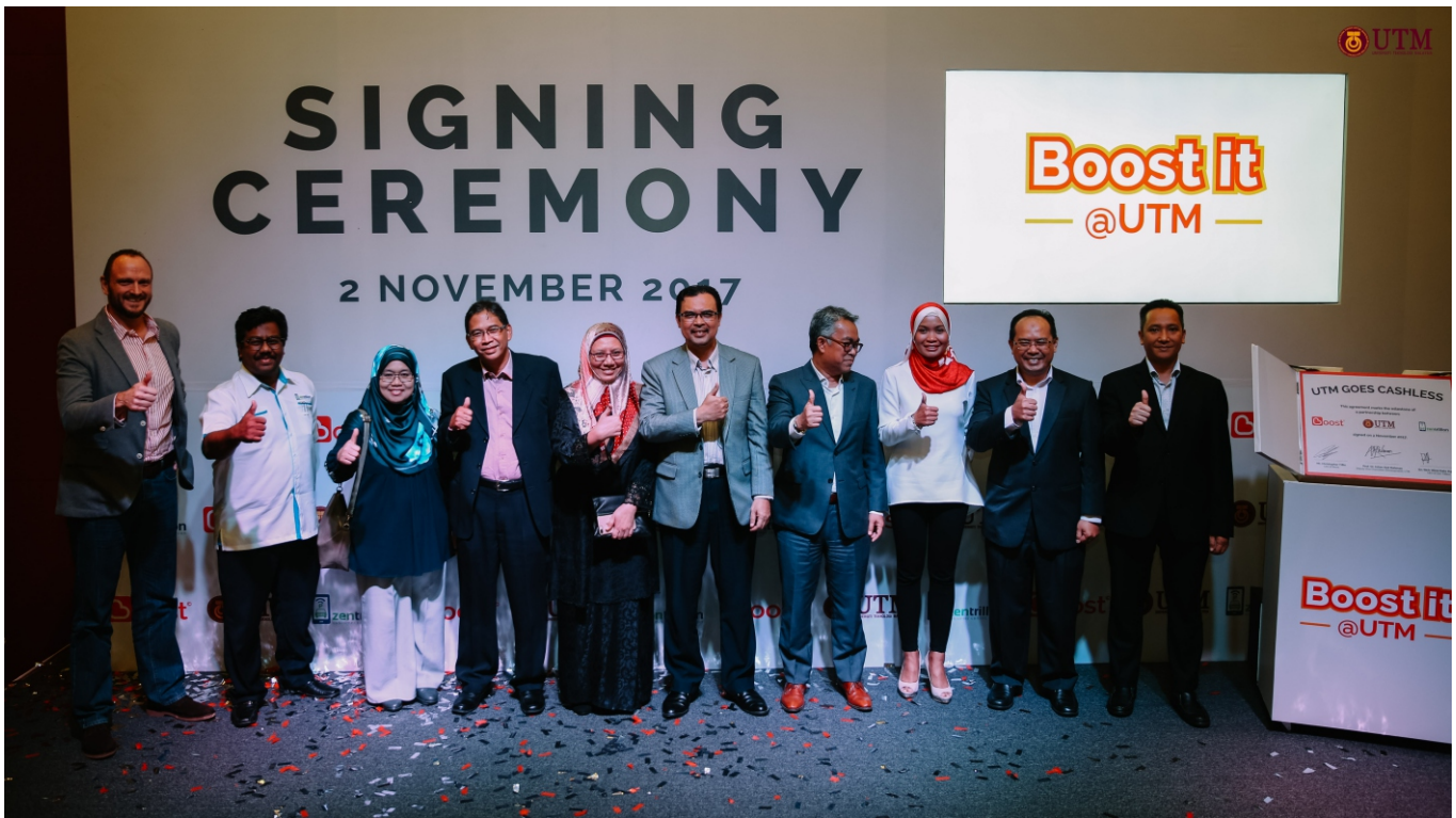
Participants of Signing Ceremony UTM and Boost

Boost, an app-based innovative mobile wallet, recently announced a milestone partnership with Universiti Teknologi Malaysia (UTM) to create Malaysia's first "Cashless Campus". With Boost activated on smartphones, all 25,000 students and faculty members across UTM Kuala Lumpur and Skudai campuses will be able to use the mobile wallet as the single mode of payment for all on-campus purchases.