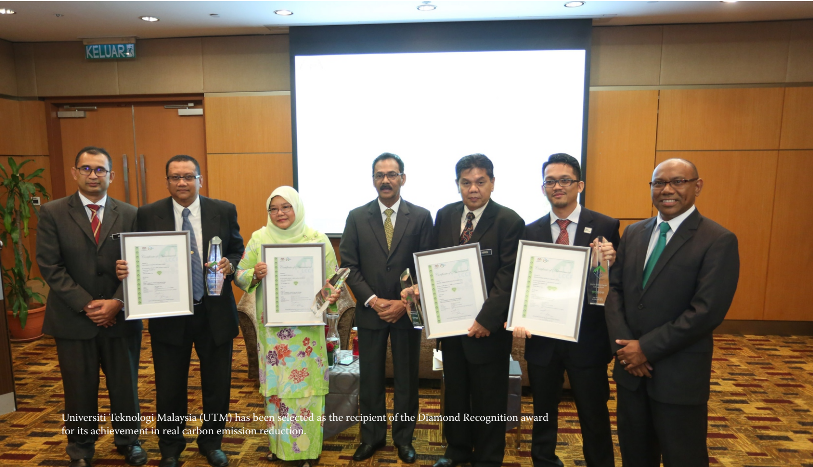
Universiti Teknologi Malaysia (UTM) has been selected as the recipient of the Diamond Recognition award for its achievement in real carbon emission reduction.