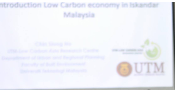
L3. Low Carbon City Development