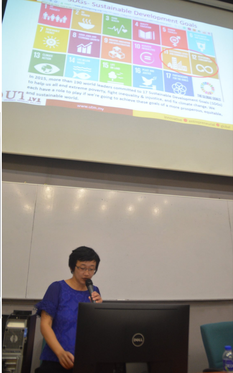
L4. Sustainable Consumption & Production