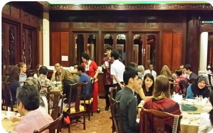
MIT-UTM Malaysia Sustainable Cities Program

UTM-Imperial College London MoA Signing Ceremony & Launching of The UTM Centre for Low Carbon Transport