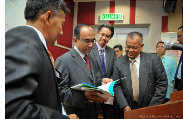
MOU DI ANTARA UTM DENGAN SILTERRA MALAYSIA SDN BHD