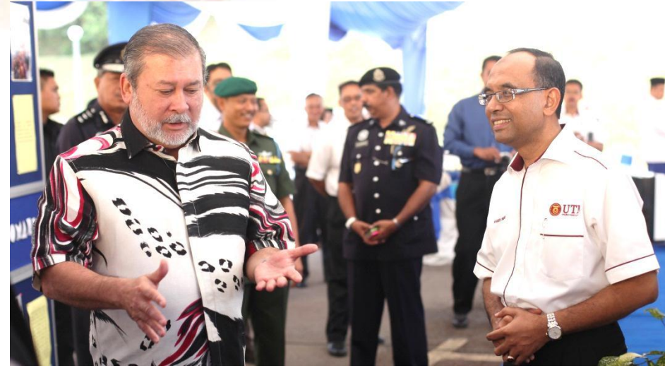
DYMM Sultan Johor @ UTM Johor Bahru