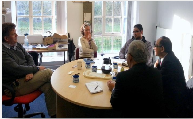
Visit to Cambridge University