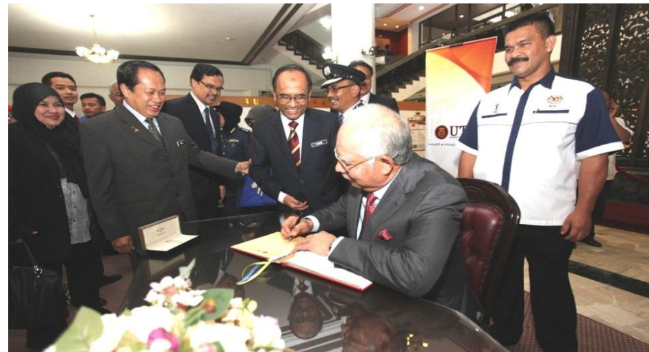
Prime Minister @ UTM Johor Bahru