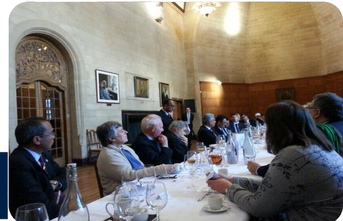
UTM-OXCIS Roundtable Conference