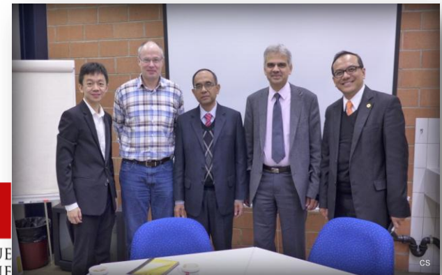
Visit to Ecole Polytechnic Federale De Lausanne(EPFL), Geneva