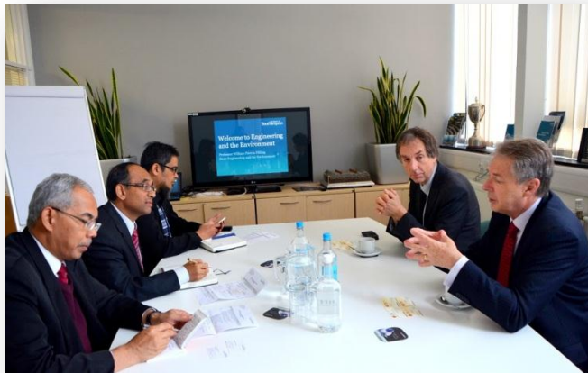
Visit to Southampton University